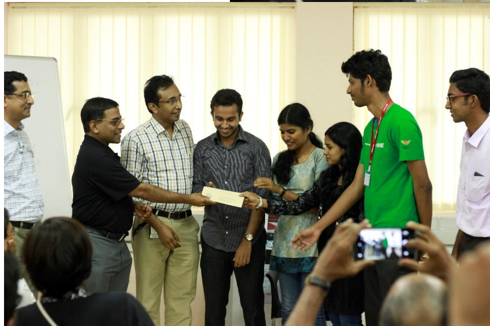
SECOND PRIZE WINNERS