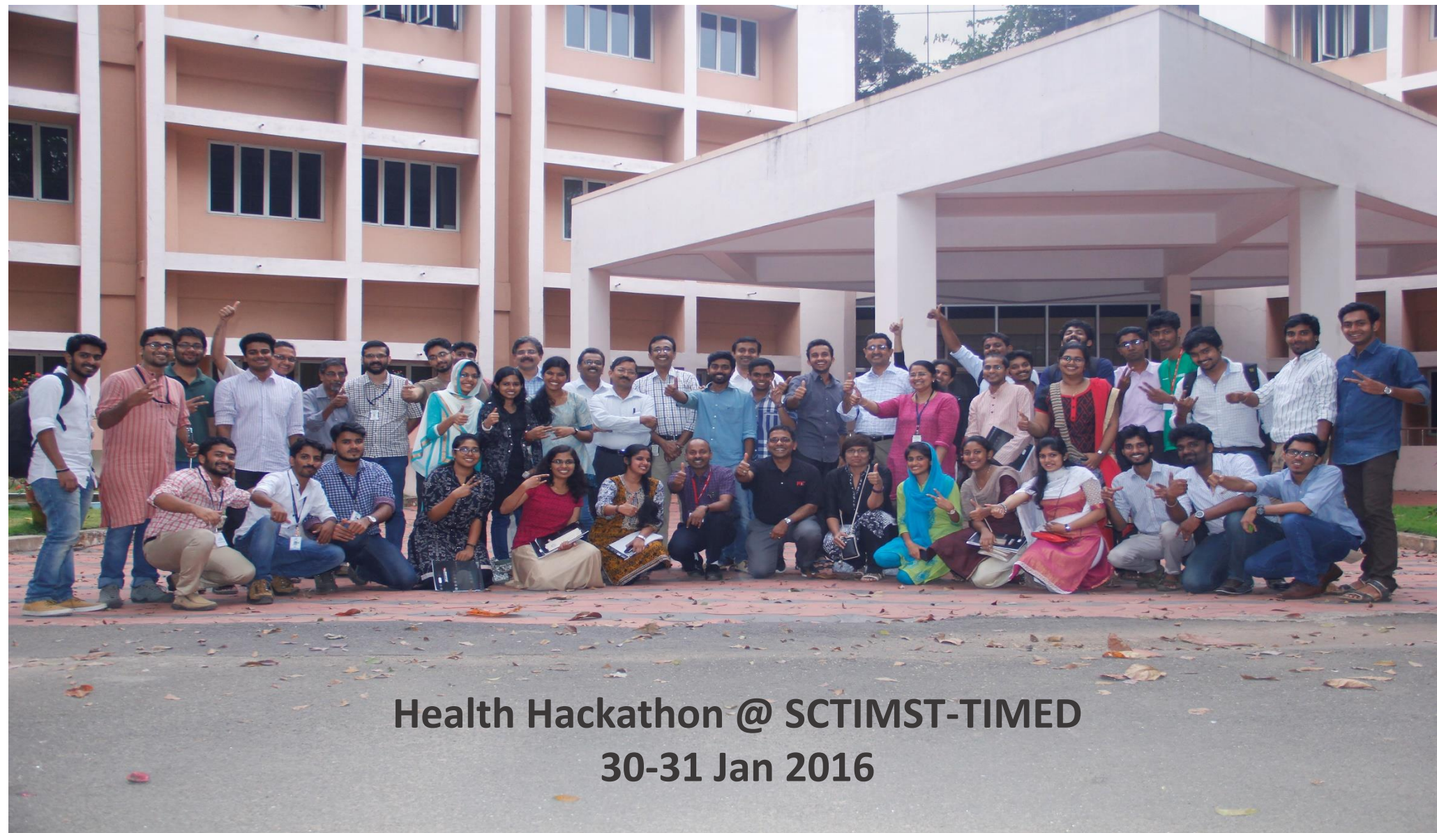
Health Hackathon @ SCTIMST-TIMED 30-31 Jan 2016