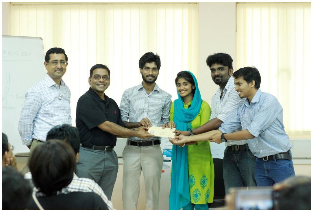
FIRST PRIZE WINNERS