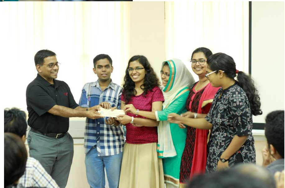
THIRD PRIZE WINNERS